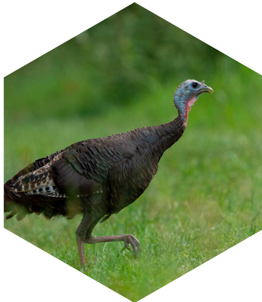
Turkey (Garland Kitts)

Dues for our club are due every September and can be paid in person at the September meeting. Other options are mailing a check to the address on the back of the newsletter or clicking roanokevalleybirdclub.com/Membership.html and completing the online form. $15 covers for a single membership and $25 for a family Student memberships are $10. Membership benefits include receiving our monthly newsletter and having voting privileges; however, visitors are welcome to attend meetings and bird walks for free.